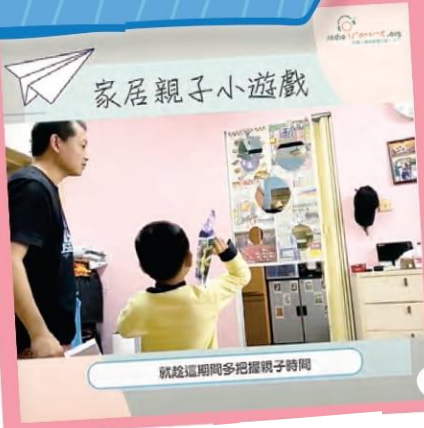
Games at Home