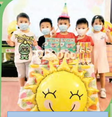
Happy Birthday Party