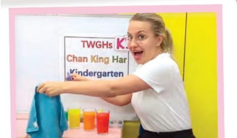
Happy English (K1)