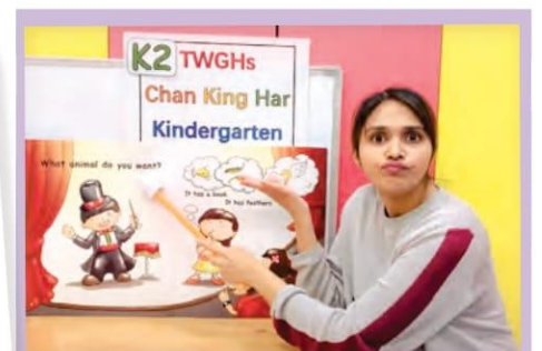
Happy English (K2)