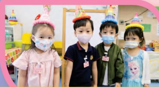
The school helped us celebrate our birthday, so happy!