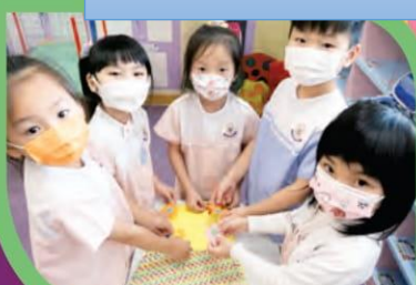
Add beautiful patterns to new clothes