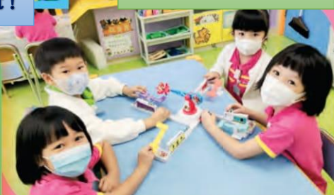
Exploring the Balance of Small Airplanes