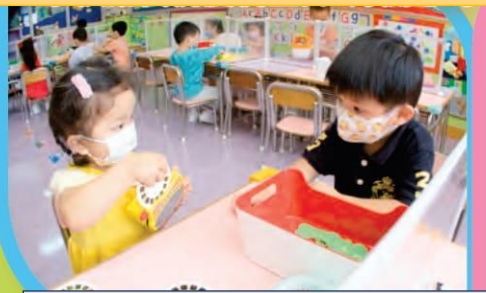
2 Search, what animal is in the negative?