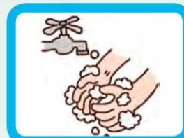
Wash hands regularly