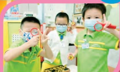
enlarge! Zoom out? Come and see !