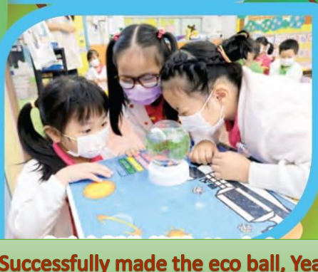
Successfully made the eco ball, Yeah!