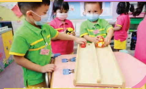
How does the car go on the incline?