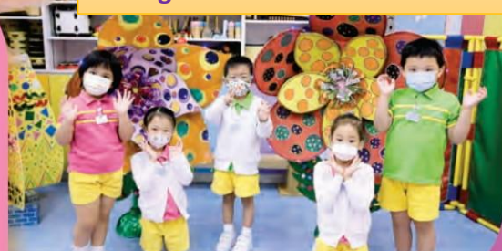
Look! our art flowers