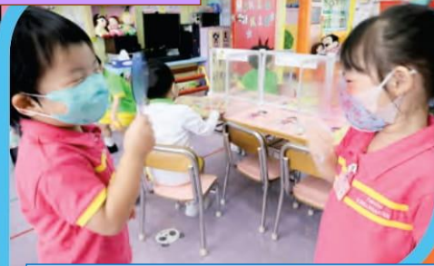
Look! I changed the color of the world