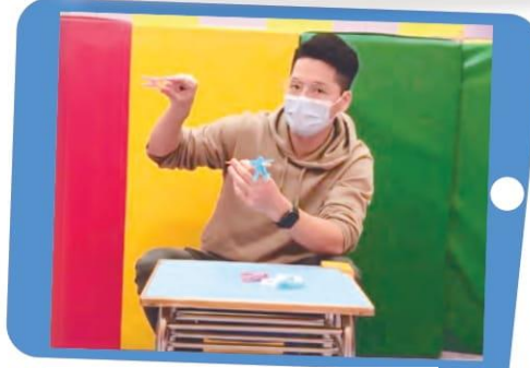
Small Muscle Home Activities