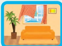
Maintain good indoor ventilation