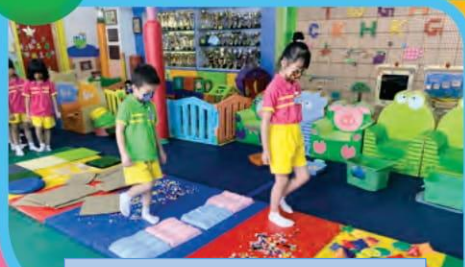
Barefoot feels different !