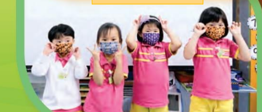
Do you know what we're pretending to be?