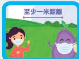
Observe social distancing