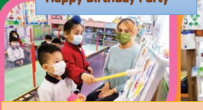
Let see who can point out the answer faster!