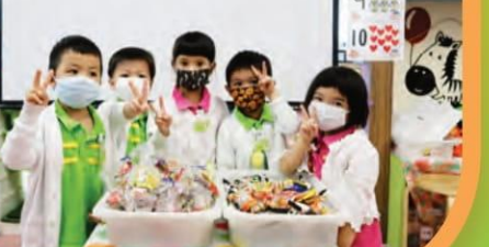
trick or treat!