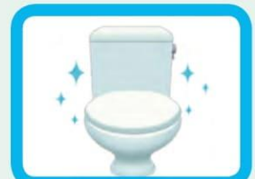
After using the toilet, put the toilet lid and flush