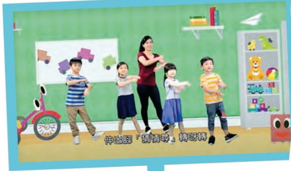
Play and Dance