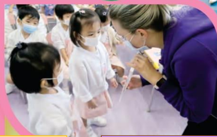
Conversation with Net teachers is easy !