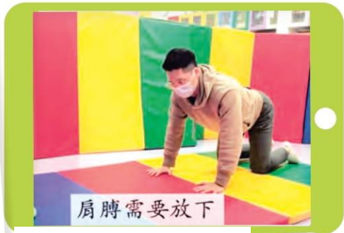
Big Muscle Home Activities

Occupational therapist, Little knowledge