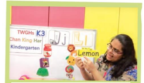
Happy English (K3)