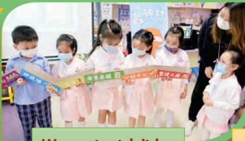
We must catch it !